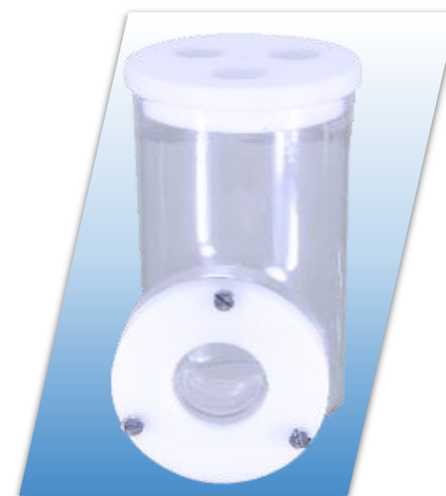
Photoelectrochemical cell (150mL) Product ID: KEC11