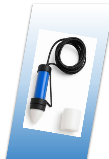
Cu/CuSO 4 Reference Electrode Product ID: KRE07