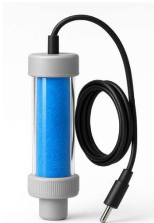
Cu/ CuSO 4 reference electrode